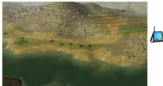
Figure 2: KMS-820 systems mesh network configuration